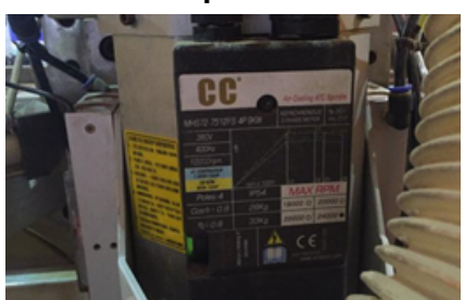
INVT Servo motor