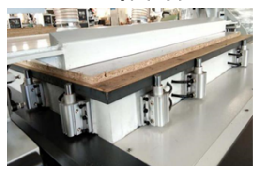
Positioning pop up pins