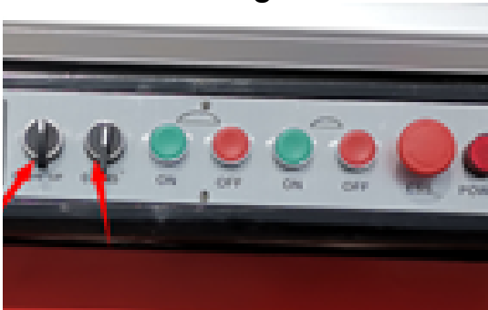
Electric control for main saw up/down and tilting 0-45°