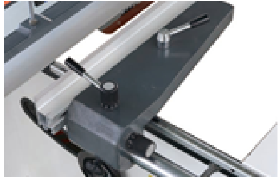
Micro adjustment, stable and precision