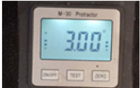
Tilting digital readout