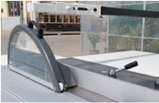
Iron Dust Cover