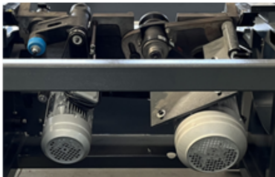
5.5kw main motor + 1.1kw scoring motor