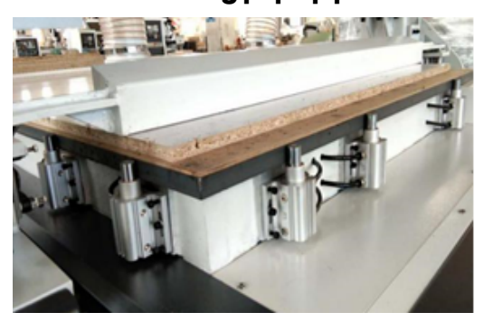
Positioning pop up pins