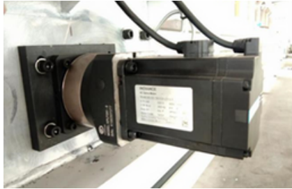
INVT Servo motor