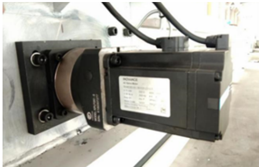
INVT Servo motor