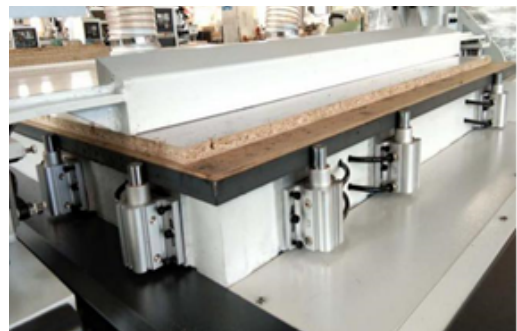
Positioning pop up pins