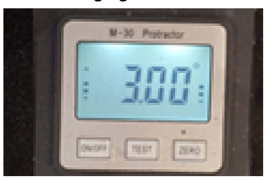
Tilting digital readout