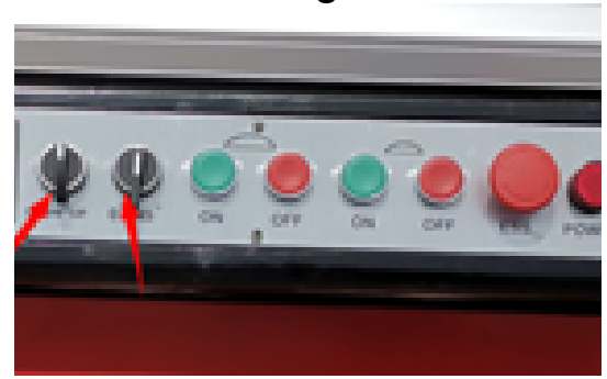
Electric control for main saw up/down and tilting 0-45°